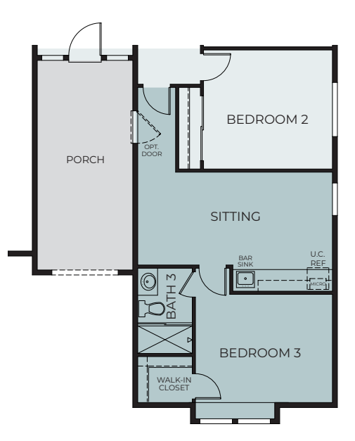
Optional Multi-Gen at Bedroom 3 and 3rd Car Garage

McCaffrey Homes reserves the right to change floor plans, dimensions, exteriors, specifications, included amenities, and product types without prior notice or obligations. All square footages stated are approximate. Actual square footage will vary. Architectural illustrations are artist conceptions and are not necessarily to scale and are not intended to be an actual depiction of such items. Included features vary throughout the models and are subject to change without notice. Information about community association facilities and assessments is available in the Sales Office. Homes, prices, financing, incentives, and included features are subject to prior sale, change or cancellation without notice. The McCaffrey Group, Inc. dba McCaffrey Homes. Offered by McCaffrey Homes. Realty, Inc., CA Real Estate Broker #0122049