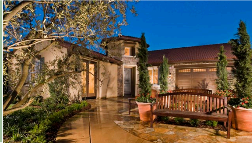
The award-winning Tuscan Castle model at Madison Place

For the second time this year, our Tuscan Castle model at Madison Place has received a major national honor from the building industry! In June, McCaffrey Homes was honored with a Gold Nugget Award at the Pacific Coast Builders Conference in San Francisco out of a field of 520 entries.