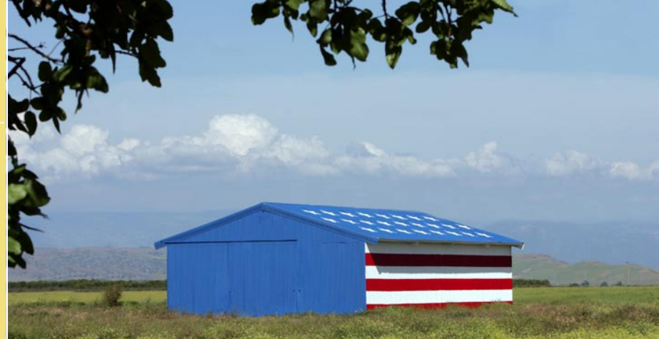
McCaffrey Homes' red, white and blue barn proclaims our love for the American way of life

Tending to these simple tasks will help keep your home cool and comfortable this season from the sizzling hot days of summer. For your convenience, additional homeowner maintenance tips can be found in your Homeowner's Manual or please do not hesitate to contact our Customer Service department at (559) 256-7000. Enjoy a summer of fun!