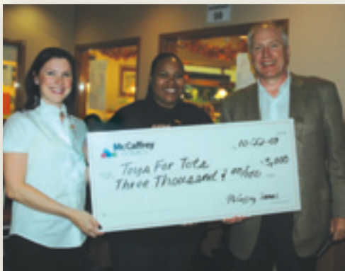
McCaffrey Homes supports Toys for Tots with a $3,000 contribution to make holiday wishes come true for children.

We also support the Big Fresno Fair with