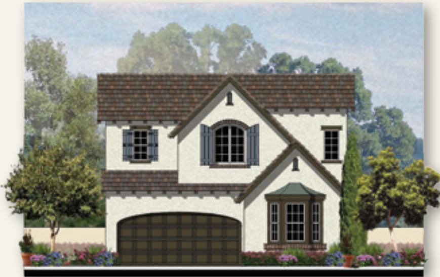
Coming soon Braden Court in Clovis with 4 new models and greener living through smarter design. Residence 4 shown above.

Want to be a part of a vibrant, growing community, one filled with possibilities? Welcome to Braden Court from McCaffrey Homes. Braden Court creates a stylish new Clovis address in Loma Vista, Clovis's master planned community.