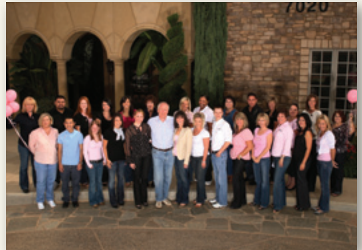
McCaffrey Homes proudly teams up and dresses down to support the Central Valley Susan G. Komen Foundation branch to fight Breast Cancer.

For years we have partnered with the Susan G. Komen Foundation in the fight against breast cancer. Every October, McCaffrey Homes' team members, business associates, and trade contractors contribute $5 each to wear their favorite jeans to work for a special Casual Friday. McCaffrey Homes then matches their donations for an even greater impact. Best of all, the contributions are at work right here in the local Susan G. Komen branch. Susan G. Komen is the largest nonprofit dedicated to fighting breast cancer.