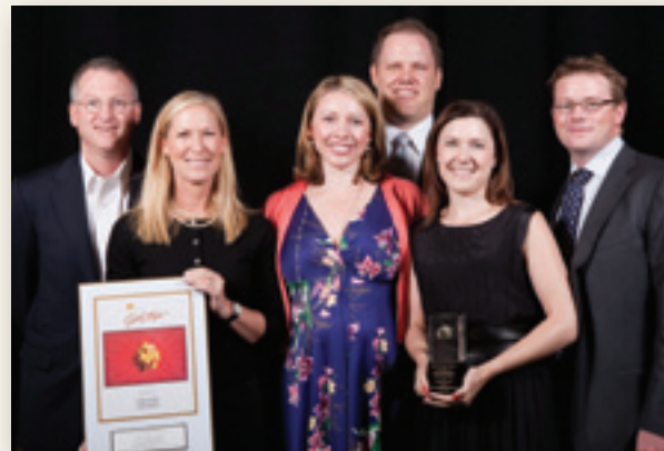
The McCaffrey Homes team accepts the Gold Nugget Grand Award for the Genoa plan Palmina in Clovis.

At McCaffrey Homes, we're thrilled to have added a number of awards for architectural design and sales volume to the coveted industry honors we've