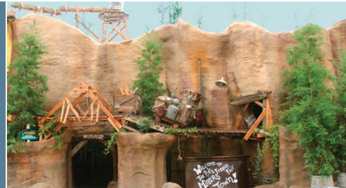
McCaffrey Homes' Miner's Town at Fresno Fair

For information on ENERGY STAR, visit energystar.gov .