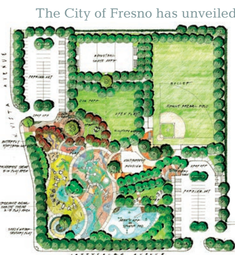
Proposed new park at Gettysburg and Vista Avenue